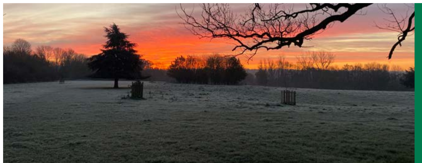
Pishiobury chilly sunrise

We will ensure that our cross cutting services coordinate litter picking and bin emptying services and engage positively and supportively with residents or community groups wishing to litter pick as volunteers.