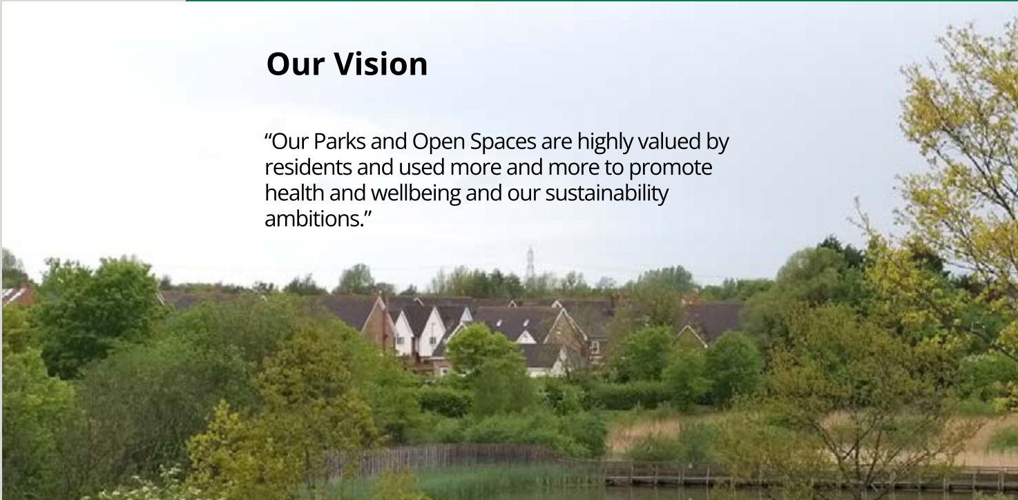
Southern Country Park main pond area

“Our Parks and Open Spaces are highly valued by residents and used more and more to promote health and wellbeing and our sustainability ambitions.”