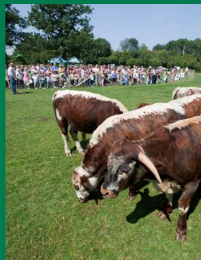
Pishiobury Park cattle at Love Parks Week event

Local Nature Reserve status and a protected historical landscape emphasised the need to conserve and develop the park's biodiversity and fascinating history.