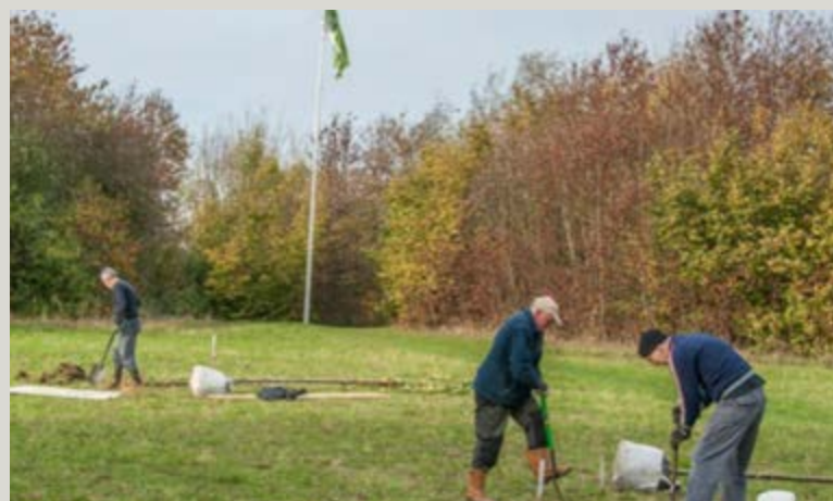
Southern Country Park Friends group

It was handed to the Council by developers as a well maintained and tidy park but somewhat bland and sterile. We worked with local people to develop a greenspace action plan in partnership with CMS which resulted in the formation of the enthusiastic and active Friends of Southern Country Park. That management plan explored what could be done to improve the park and how residents felt about this. It created an agreed action plan of the higher priority works for a five year period. The Friends group were empowered to work with us to seek further investment and to carry out long term tasks alongside Council developed projects that progressively transformed the