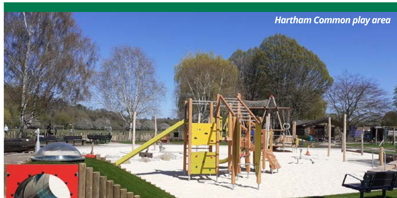
Hartham Common play area