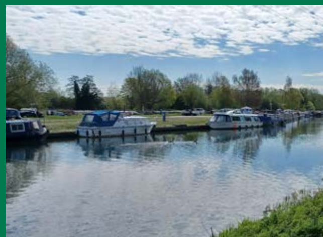
Lawrence Avenue Moorings

might facilitate different entrance and exit points to manage congestion and will need well designed infrastructure to safely combine cycle and pedestrian access alongside vehicles where necessary.