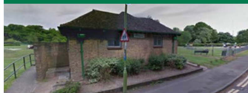
Hartham Common play area pre-transformation

Increased awareness of the project through working with local users in this way provided further opportunities to engage with local