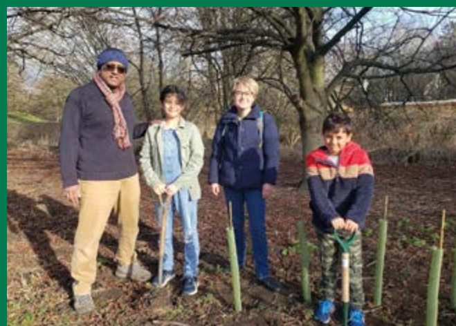
Friends of Castle Park event