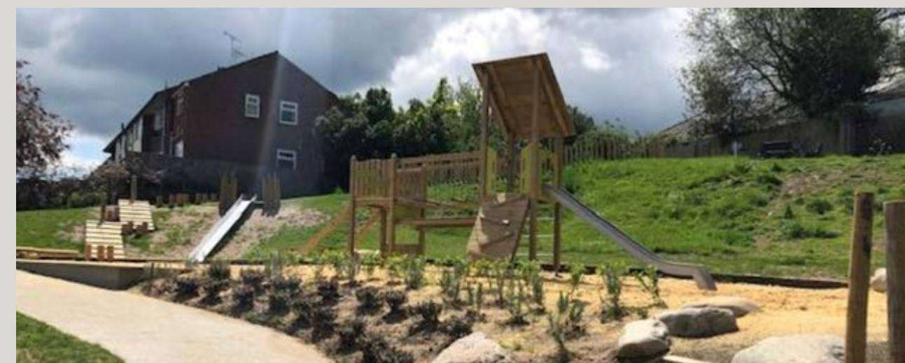
Trinity play area, Bishop's Stortford