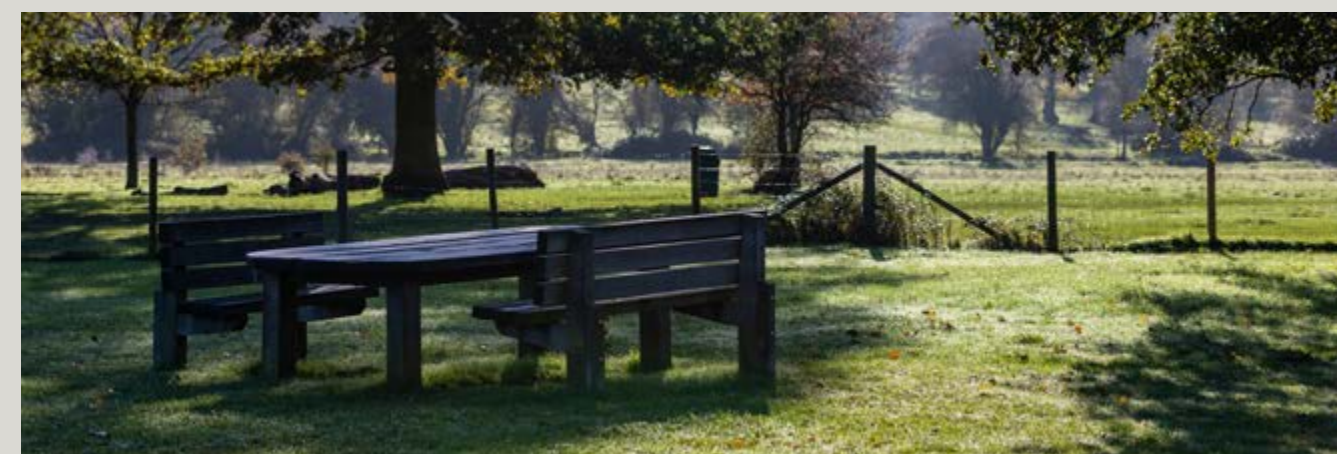
Pishiobury Park picnic area

Encouraging parents and young people to use play areas responsibly is another example of sensible communication, creating safe yet challenging play